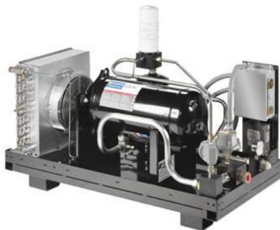
Figure 2 : Copeland Scroll® Single and Dual Compressor Modules.